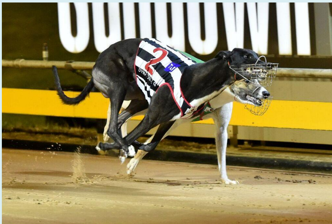
Last Year's exciting finish with Dyna Double defeating his kennelmate Fernando Bale